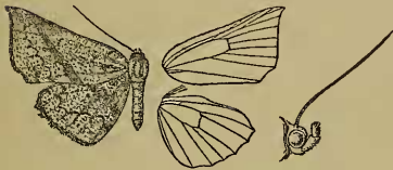
Schistophyle falcifera , ♀ \frac{1}{2}

♀. Yellowish-white, thickly irrorated with orange-red; abdomen dorsally suffused with fuscous on medial segments. Forewing with the costa red-brown, broadly so towards apex; an antemedial brown line very acutely angled below costa; both wings with discocellular brown point: